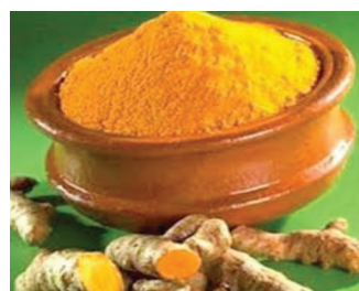
Curcumin from turmeric