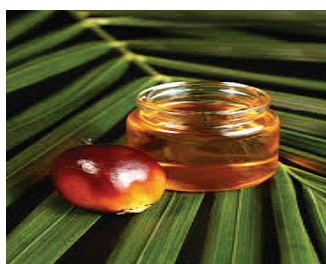
Tocotrienols from palm oil