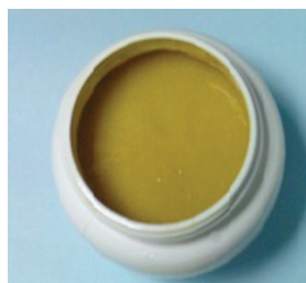
Tocotrienol + Curcumin cream